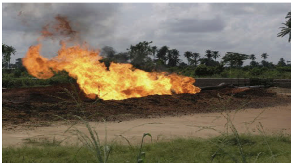
Pipeline fire in Nigeria

MEND is the group believed to be behind the recent spate of attacks which has precipitated a new security environment. MEND has claimed responsibility for a number of incidents; including the kidnappings of four expatriate Shell oil workers on 12 January, an assault on a Shell oil platform in 16 January, a car bombing in Port Harcourt on 20 April targeting the Nigerian army, and a car bombing at a refinery in Warri on 30 April. MEND have also claimed to have attacked oil platforms operated by France's Total and Italy's Agip, which the companies have denied. Since January, MEND has killed at least 24 soldiers and police, kidnapped 13 oil workers and caused severe damage to several critical oil pipelines.