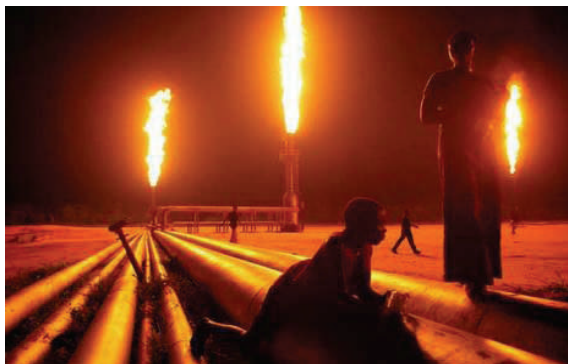
Pillars of Fire illuminate the Niger Delta— Projecting scorching heat and light throughout the evening

With President Obasanjo now out of the running for the forthcoming elections in 2007, stability in the Delta will depend heavily on his successor. The Delta region has never produced a president and it seems unlikely the Delta peoples will have a representative in power in Abuja who will advance their interests sufficiently to stabilise the region. Increased levels of violence are expected in the run up